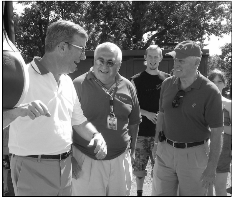
Canada Day in Kanata, Ontario with Mayor Jim Watson and Councillor Allan Hubley.